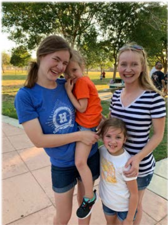
Using spiritual gifts to serve the body of Christ.