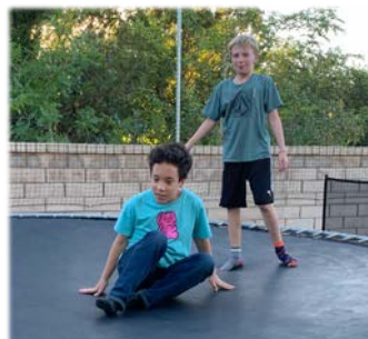
Family, friends, teams, playing, laughing, & singing.