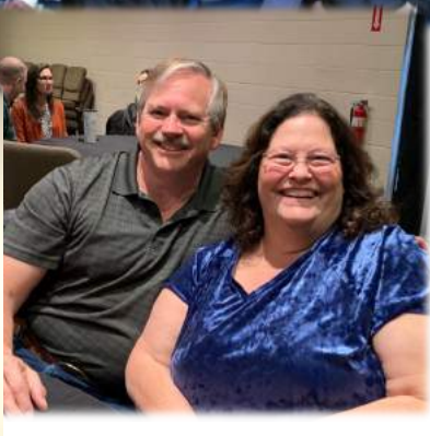
Family of Faith