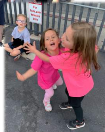
Family of Fun