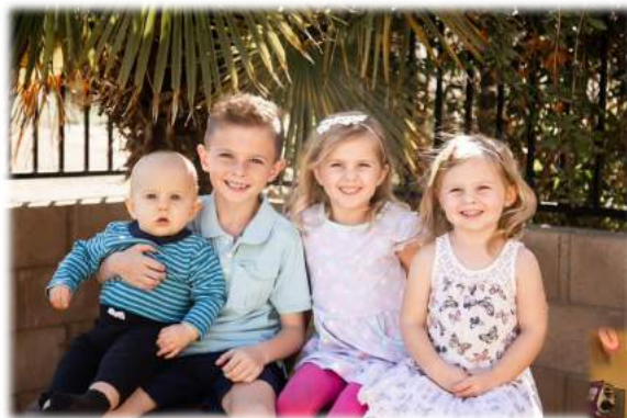
Family of Prayer

Remember it is not the gift our hearts so desperately need but the King who sits upon the throne, the Lamb of God who takes away the sin of the world, and the great I Am who makes all things right on that day so quickly coming.