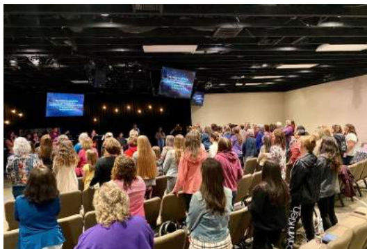
Family of Worship