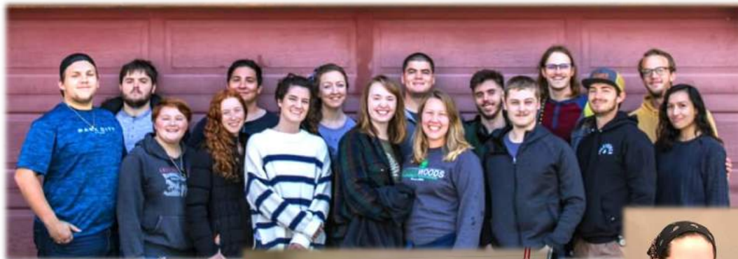
Family of God

"When a Christian realizes his citizenship is in heaven, he will start acting responsibly on earth." —Joni Erickson Tada