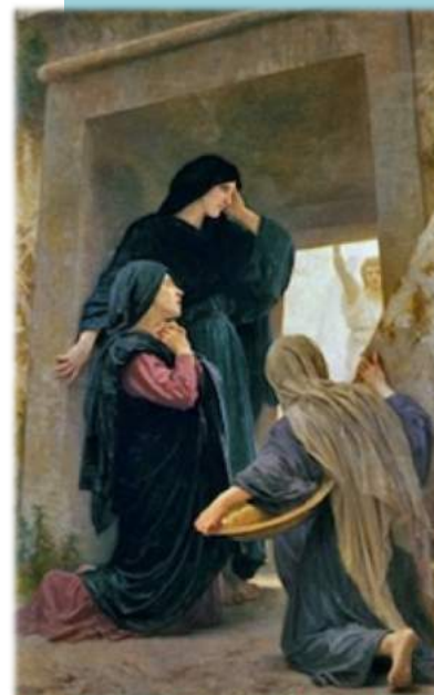
Women at the Tomb by William Bouguereau

* A retelling of the story from the four Gospels.